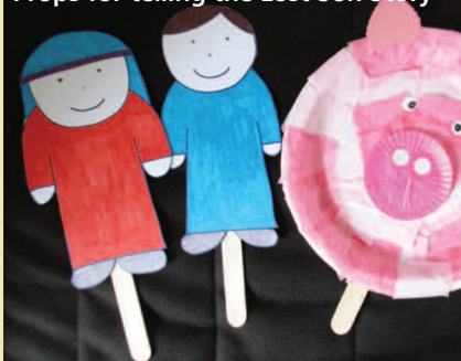
Props for telling the Lost Son Story

If you are wondering how to get started or looking for some ideas for your Toddler Group story time then visit our blog www.let-theirlightshine.com . You'll find lots of ideas for Bible stories and related crafts