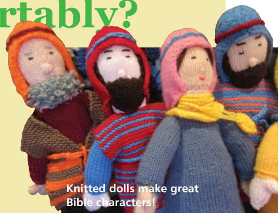
Knitted dolls make great Bible characters!

and a few tips about telling the story to the group. If you would like any help then you can contact me at cefofeastlondon@aol.com .