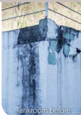
Tankroom before ...

of cement with sealing material added. The rainwater now drains off into the pipe system and the steps leading to the washlines are extended for easier access. The railing, rack and outer wall were cleaned and freshly painted and as a nice finish, new washlines were