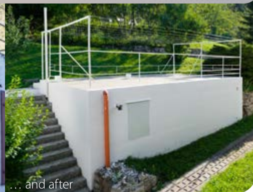
... and after

strung. We want to extend our heartfelt thanks for your generous donations which covered the entire cost.