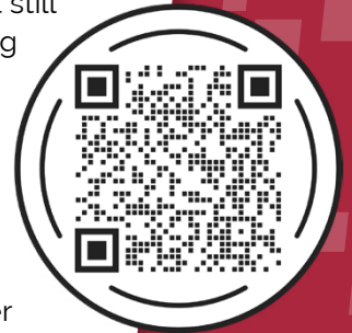
Scan to watch a video on the 2023 statistics.

Inters camps for 11–15 year-olds are always busy, noisy, and full of fun! Our Inters camp in August 2023 was very special. Over 80 young people enjoyed a great week together, and it was such a joy to see three of them come to faith in the Lord Jesus. The young Christians were encouraged to get involved in serving the Lord and as a result we now have 15 coming to learn about reaching children with the Gospel at our Junior Summer Outreach Training Course in July. We look forward to seeing these young people play a key role in reaching boys and girls in the future!